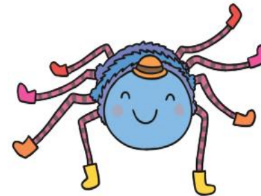
Lincy Wincy Spider