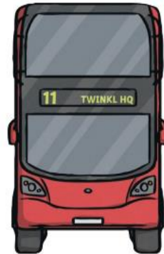
The Wheels on the Bus