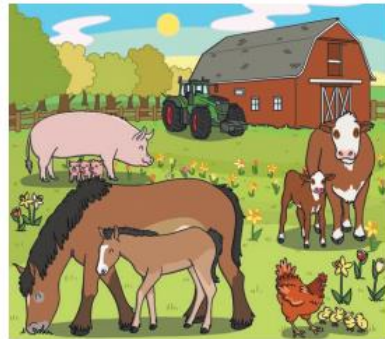
Old MacDonald Had a Farm