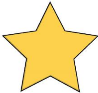
Twinkle, Twinkle, Little Star