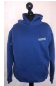
Royal blue hooded sweatshirt (available with school logo)