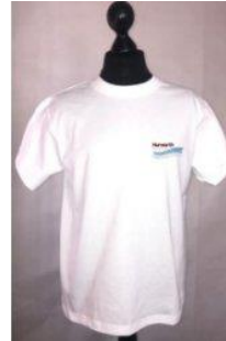
White T-shirt (available with school logo)