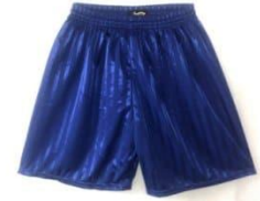
Royal blue shorts