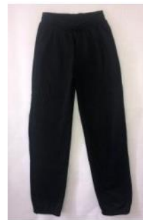
Long, plain jogging bottoms or leggings